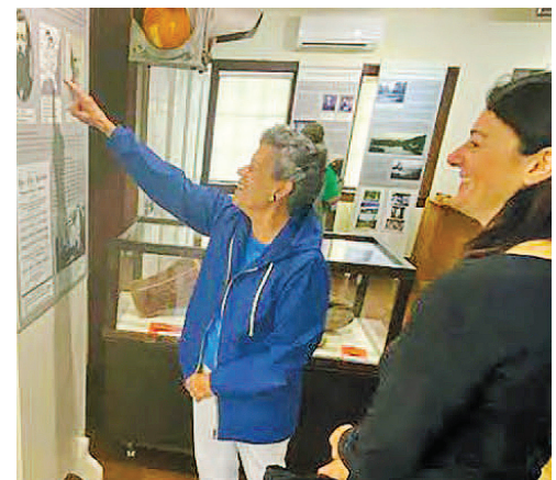
Large descriptive wall panels highlight Highlands history