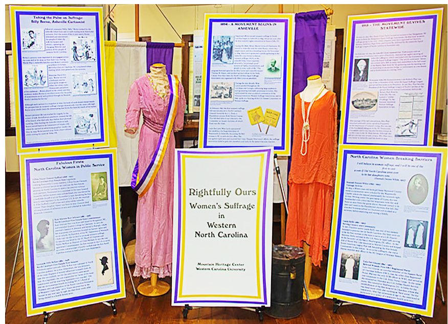
The Nineteenth Amendment Exhibit

Last year marked the centennial celebration of the ratification of the Nineteenth Amendment granting women the right to vote, and this display highlights the contributions of the barrier breaking women in WNC who fought so hard for this right.