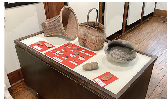
Cherokee artifacts on display