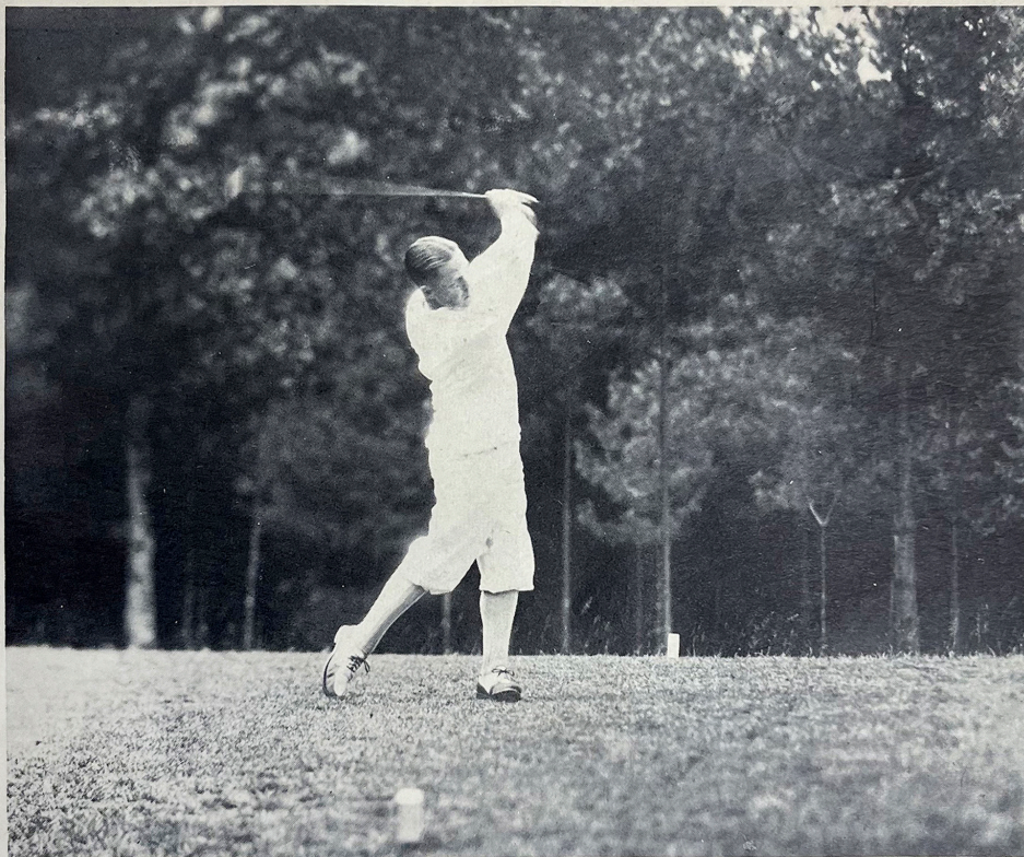
Robert Tyre Jones Jr. at Highlands Country Club

FOR THE BENEFIT OF Highlands-Cashiers Hospital Endowment Fund