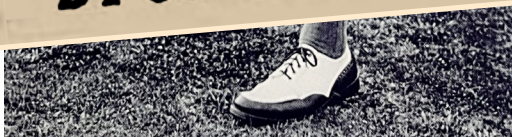
Franklin Press June 23, 1927

HIGHLANDS FUTURE NOW ASSURED BY CONSTRUCTION OF GOLF COURSE